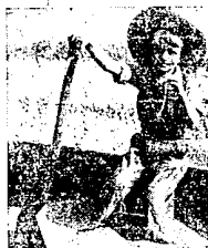
Fertile Soil Makes Strong Bodies.

"Records of a special study by the Department of Rural Sociology at the Ohio Agricultural Experiment Station showed that six of each ten town and country men examined for Selective Service during a recent