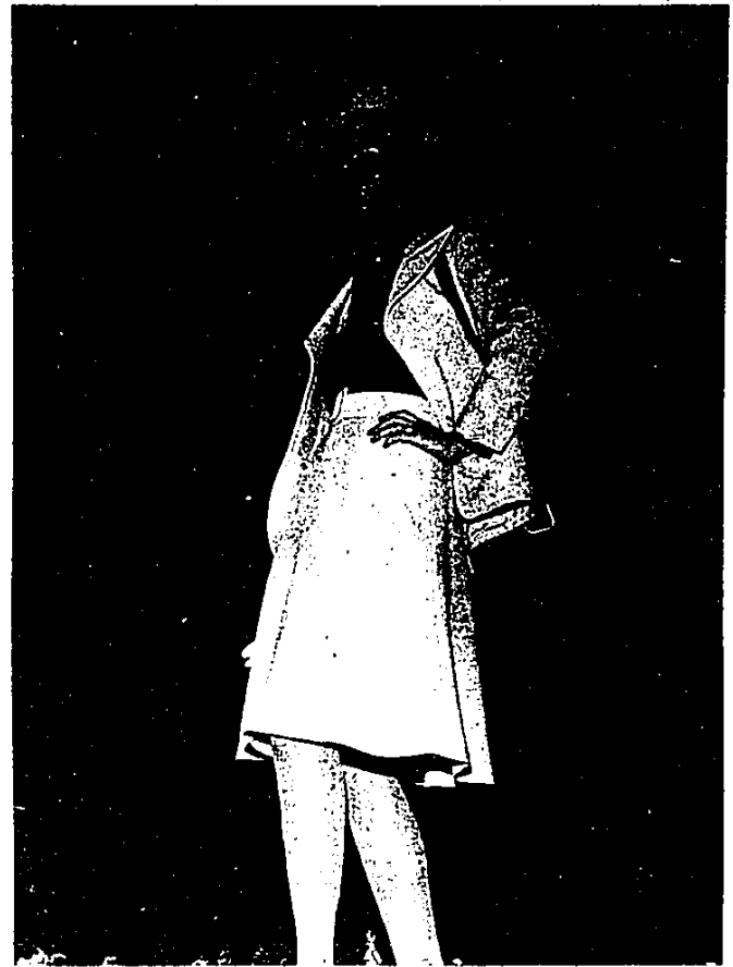
HATS AND JACKETS are part of the classical look for women.

"Junior fashions are about a year behind women's fashions," she said, "and children's fashions are about a year behind juniors."