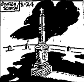
Today the site highlights a visit to the monument in St. Ignace, named for the mission.