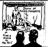
On May 18, 1875, beside the blue island site, an historic post-fleeting was ended.