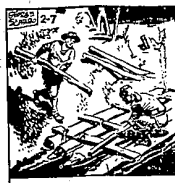
Rafting over the St. Joseph, he headed for Ft. Frontenac (Kingston, Ont.).