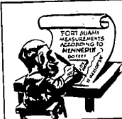
On the St. Joseph's west bank a fort was built and its area is known.