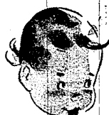
PHOTOGRAPHS OF YOUR CHILD TAKEN FREQUENTLY WILL BE YOUR MOST PRIZED POSSESSION

Poor Wool Poor wool feels harsh and greasy and has a slight odor.