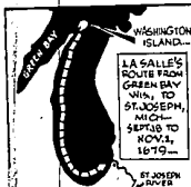
Enduring extreme privation, La Salle and 14 men already were headed south.