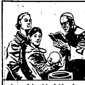
Age of humble faith—from grade to grave their pastor yet a certain guide.