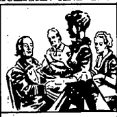
Frequent religious festivals fostered an unhurried and a kindly disposition.