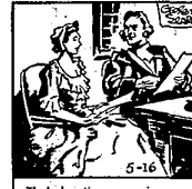
Their baptisms, marriages, death may be taken. This is important.