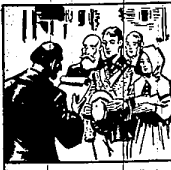
A news source: the bulletin published after mass: Few habitants could read.