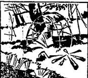
But soon Indian lodges near the missions were abandoned, notably at St. Ignace.