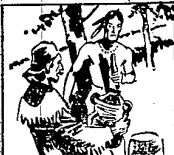
Jesus' fought Cadillac's use of brandy to keep the tribes loyal.