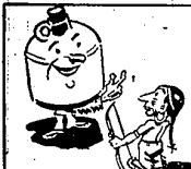
To the Indian alcohol was more devastating than war, smallpox or famine.