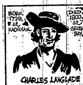
CHARLES LANGLADE Michigan's most noted half-breed was Charles Langlade, his mother an Ottawa.