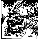
They included Pickewillany, Braddock's defeat, Quebec, 1780; St. Louis raid;