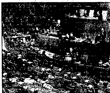
FLUSHING, L.I., N.Y. — Soundphoto — General view of the As- sembly on the opening day as the delegates were addressed by Presi- dent Truman.

Three proposed amendments to the State Constitution are to be voted on. The first is a proposed amendment limiting state control and participation to certain inter- nal improvements. It reads: "Shall Section 14 of Article 10 of the State Constitution be amend- ed to authorize the state to con- trol, develop, improve or assist in the development, improvement and control of (1) public roads, highways, airports, landing fields and aeronautical facilities (2) rivers, streams, lakes and water levels for purposes of drainage, public health, control of flood waters and soil erosion, (3) in reforestation, pro- tection and improvements of