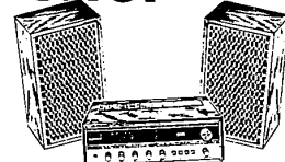
THE FISHER 450-T 180-Watt Remote Control Receiver

A truly magnificent unit, with a vast array of features and a huge power reserve. Ideal for the dedicated audiophile, as well as all those to whom the life-like reproduction of a variety of entertainment and educational materials on records, tape and FM is an important part of daily living.