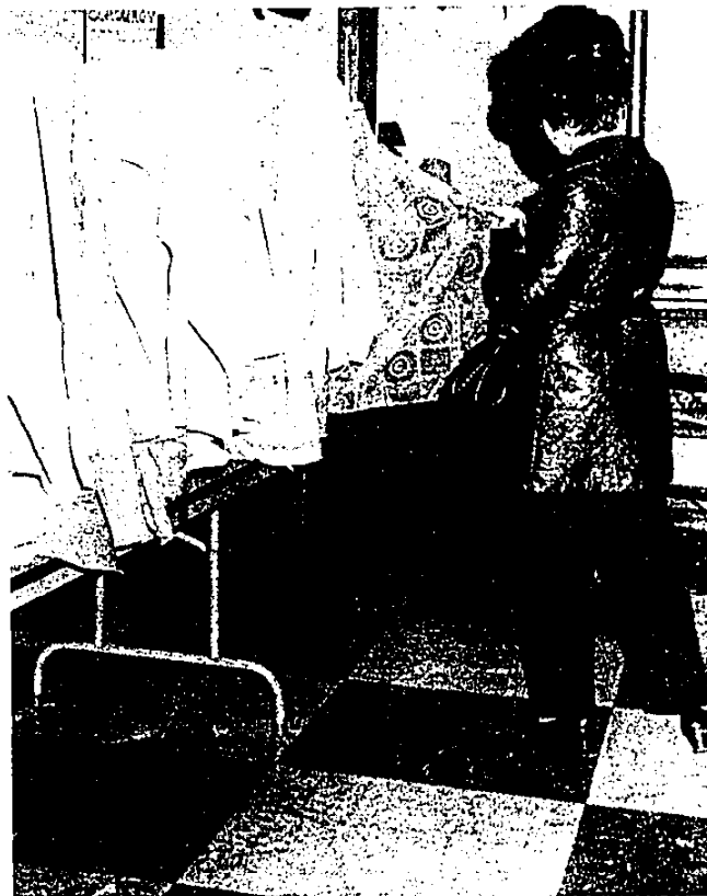
THE SEAMSTRESS looking for knits now can find all the variety she wants.

Brushing garments with a stiff-bristled brush after drycleaning or laundering will help to loosen and remove the pills. You may use an electric shaver to remove the pills, but you must be very cautious so you get only the fuzz and do not damage the fabric, she adds.