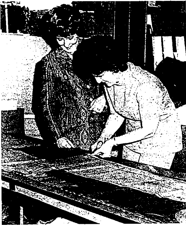
PROPER PLACING of pattern on material is a big part of skillful sewing.

handling the knit materials that now dominate the fabric scene.