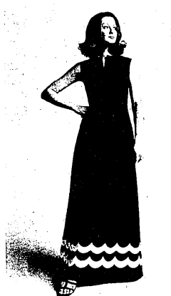
A-LINE SKIRT and easy-to-wear neckline feature this dress with trim of white vinyl by Telen. McCall Quick and Easy pattern 3133.