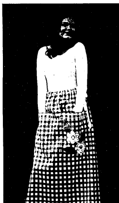
GAY GINGHAM with an appliqued posy on the pocket makes a novelty skirt. Simplicity Jiffy pattern 5123.