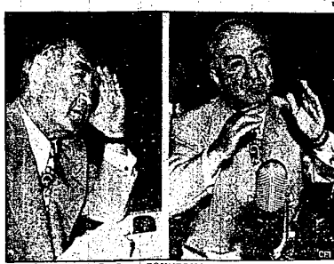
WASHINGTON, D. C. — SOUND PHOTO — Photo shows combo of James Caesar Petrillo, musicians' "czar", as he appeared before a special House investigating subcommittee, and told them that the "czar" musicians' union should be blamed for the labor management difficulties in the music field. Petrillo stated his position after he was accused of being a dictator and that his union is engaging in "unfair activities" detrimental to the nation.