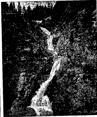
Seven Falls and the grave of Helen Hunt Jackson, author of "Ramona", are "musts" in the book of the vacationist going into Colorado, that fantastically beautiful state of mountains and lakes.

Right now high in the Rockies, the breezier are cool and refreshing, mountain streams are alive with trout, and there's scenery which is beyond description in mere black-and-white wordage. In brief, Colorado is a divine spot for a late summer vacation.