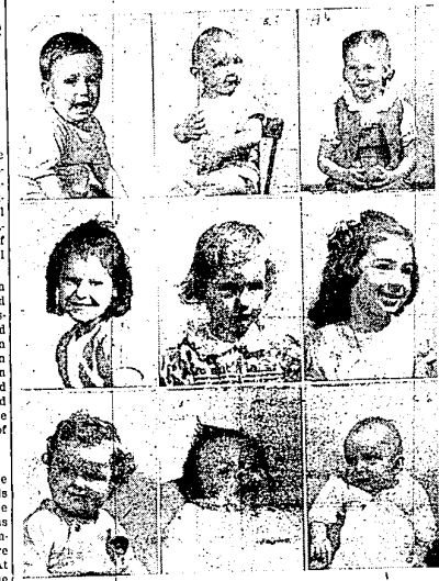
This week we present the third group of pictures of Farmington's Citizens of Tomorrow.