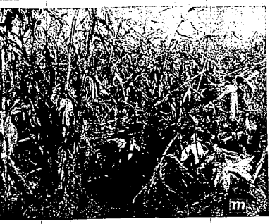
Poor Soil Structure Limited Root Growth and Caused Lodging of This Corn Crop.

CHICAGO —Good soil management practices must go hand in hand with heavy use of fertilizer if farmers are to get the most bushels possible from every pound of plant food used, declared the Middle West Soil Improvement Committee in a statement. "It is one thing to put fertilizer in the ground," says the statement. "It is another to be sure the plant roots can reach the fertilizer to feed the growing crop." "Fertilizers should be teamed up with practices that build soil structure or till. With good till roots can spread out for plant nutrients and moisture to reach the above-ground growth of crops. Vital, too, are conservation measures that will prevent erosion and keep your soil in place after it is built up." "You can protect your soil from losses by water runoff by contour plowing, seeding and cultivation. Rainfall will then have more chance to soak into the ground." "By using deep-rooted legumes and grasses regularly in the rotation, using fertilizer carrying phosphate and potash, returning manure and plowing back all the corn stalks, straw and crop aftermath, you can increase the organic matter content and improve the soil's structure."