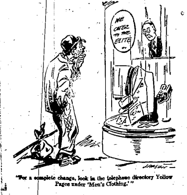
"For a complete change, look in the telephone directory Yellow Page under 'Men's Clothing'."

CHRISTIAN SCIENCE SOCIETY 23701 Cass Avenue Farmington 11:00 a.m. Morning Services and Sunday School. 8:00 p.m. Wednesday Evening Festive Meeting. Reading Room Hours, Tuesday and Saturday, 1:00 to 4:00 p.m. ALL ARE WELCOME