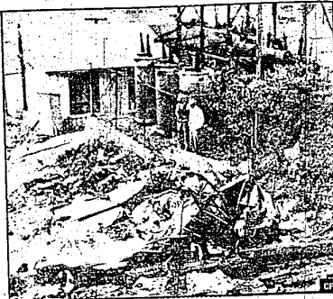
MT. CARMEL, PA. — SOUNDPHOTO — All 43 passengers and crew were killed when a United Airlines DC-6 plane crashed into a transformer station and exploded. The plane, coming down for an emergency landing due to a burning motor, burst into flames and disintegrated in the ensuing explosions. Photo shows remnants of the plane scattered about the transformer station.