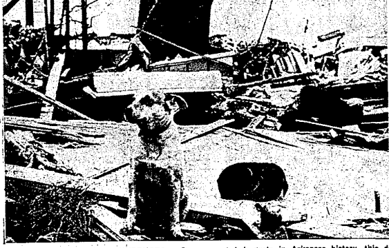
WARREN ARKANSAS Dr. worst holocaust in Arkansas history, this dog privied of her master as the result of one of the stands guard while her puppy peacefully sleeps.