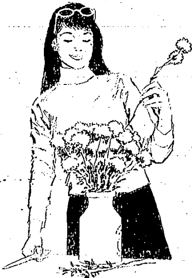
Simple and Natural: the secret to floral arrangements.

That's it! No other pointers are necessary, except, perhaps, one vital reminder: most arrangements depend upon accompanying foliage as much as the flowers themselves for their effectiveness, so don't forget to use greenery. Possible choices would include baker fern and rhododendron, magnolia, and huckleberry leaves.