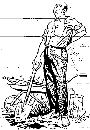
Early work on your garden may be good if you don't overdo it.

Whatever your situation, patience today will help you toward greater gardening pleasures tomorrow.