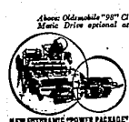
NEW HYDRA-MATIC "POWER PACKAGE"

Flawless Futuramic styling! Flashing "Rocket" Engine power! Super-smooth automatic driving with brand new Whirlaway Hydra-Matic! These are Oldsmobile's famous firsts—all major automotive advancements that make the 1950 "Rocket" Oldsmobile the style and action stars of America's highways! So step into your Oldsmobile dealer's and step out in America's