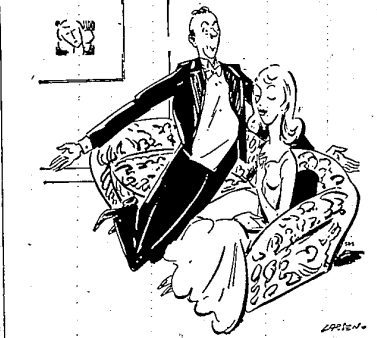
"Marry me and I'll buy you anything advertised in the telephone directory Yellow Pages."