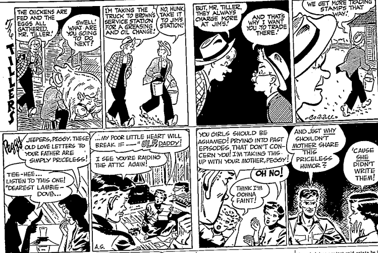
Ticklers By George