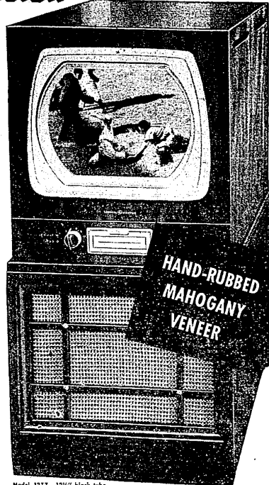
Model 1217-1218" black tube

See this beautiful GE with the Famous Black Daylight Tube