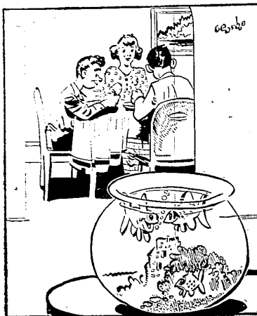
"He's hiding. He just heard that Friday was fish day."