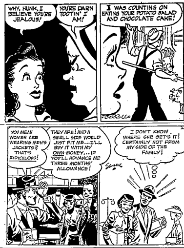
Ticklers By George