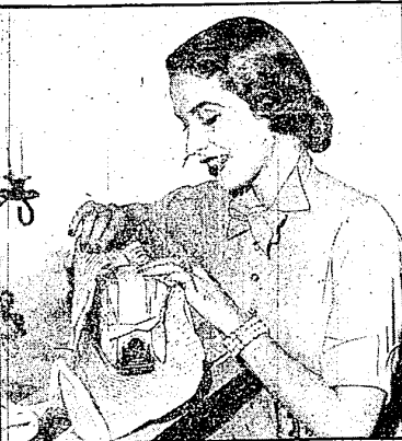
Combination package contains lotion and after-bath friction mitt.

and a non-porous pad beneath. This means that most of the mitt is kept dry during use. Used with the lotion, the mitt soothes tired nerves and gives a cool, invigorating lift.