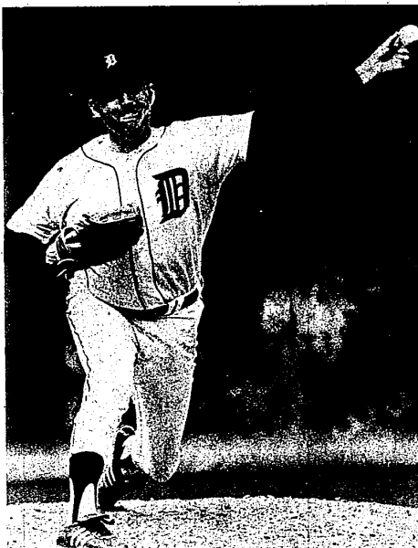
BILLY MARTIN "Twas A Cold Opener

Well, you're the manager now. What would you have done?