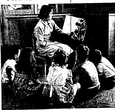
Farmington area residents are invited to the Strawberry Festival on Sunday, June 22, at 1:30 p.m. at St. Vincent's Home for Children at Twelve Mile and Ingham Road. Sponsored by the Ladies of Charity of St. Vincent de Paul, the festival proceeds will go entirely to the Children's Educational Fund.