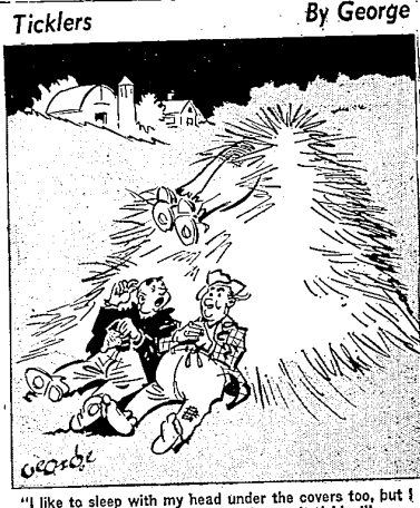
Ticklers By George

"I like to sleep with my head under the covers too, but I gotta wear a stocking cap 'cause it tickles!"