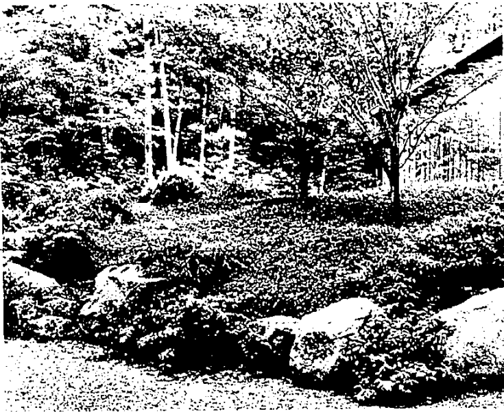
ON STEEPLY SLOPING LAND, the planting of shrubs and vines helps to prevent the damage of wind and water. About 180 million acres of land lose precious topsoil through erosion each year in this country.

nature the areas with certain typical conditions are known as "habitats." A marsh is one kind of natural habitat. A pine forest is another. Other natural habitats are dry meadows, stream-sides, beech-maple woods, and oak-hickory woods.