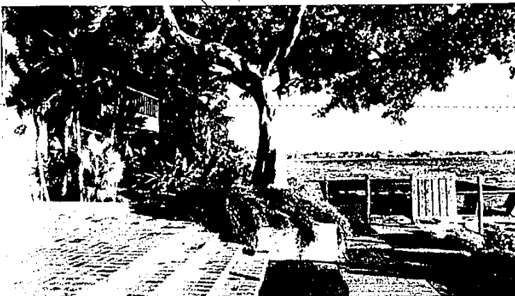
HOME GROUNDS are enhanced by the beauty and practicality of trees. Trees provide cooling shade in summer, and shed their leaves to let warm sunlight through in winter. They are nature's most effective dust traps and sound barriers.

For best results, become familiar with the conditions your yard has to offer. Know what potential habitats you have on your lot. Then choose plants that like those conditions. There are attractive plants for all situations.