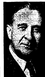
Dondero Deserves Your Support