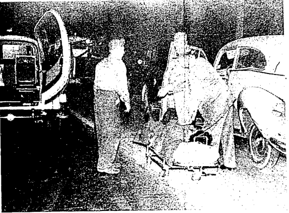
The fog was so thick on U. S. 16 last Saturday night that even the camera had difficulty picking up this scene in which five persons were injured in a six-car pile-up west of Novi...