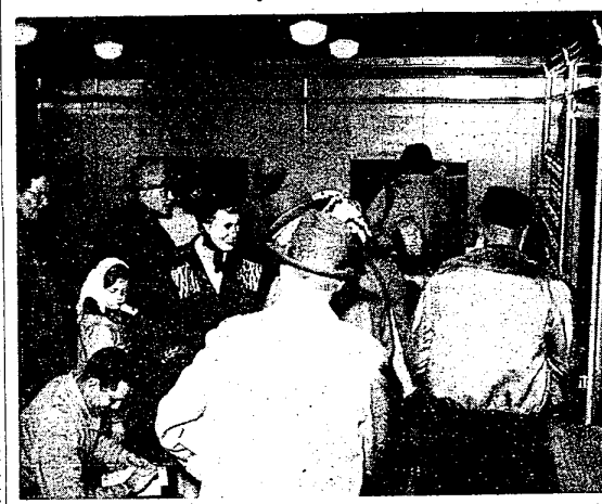
Things are really jumping at the Farmington Post Office these days with long lines piled up in front of the customer windows and tall piles of letters and packages piled up in the work room behind the partitions. This photo, taken Saturday, shows part of the crowd that jammed the lobby during the mid-morning hours.