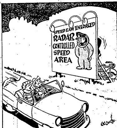
"Better slow down! They say the cops are really on the job in this area!"