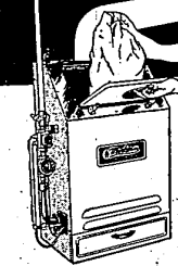
① Clean, odorless, simple to install. Hangs conveniently on your basement wall. Beautiful green or white GENUINE PORCELAIN ENAMEL finish. Dependable automatic controls.

YOU'LL LIKE THE NEW Modern HOUSEHOLD INCINERATORS