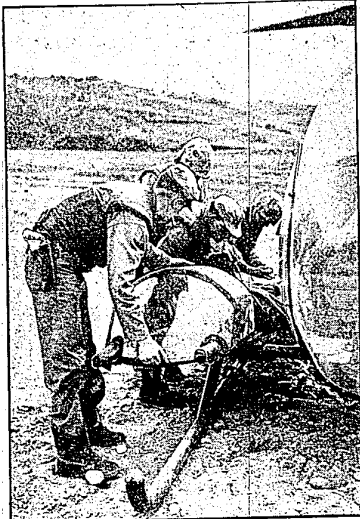
AERIAL SIDE CAR —Covered with a plastic hood, this wounded G.I. is being readied for a trip to a rear area somewhere in Korea. Stretchers fit into specially constructed side attachments of the helicopter and ride the air comfortably. This casualty victim is receiving blood plasma before making the trip.

Seven Mile - Evergreen Shopping Center Basic Haircut WITHOUT APPOINTMENT 20426 W. 7 MILE KE. 3-0020 One Block West of City Bank