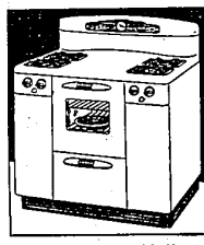
SEE THE NEW 30" TAPPAN HOLIDAY MODEL IN OPERATION

See Our COMPLETE DISPLAY of PHILGAS RANGES