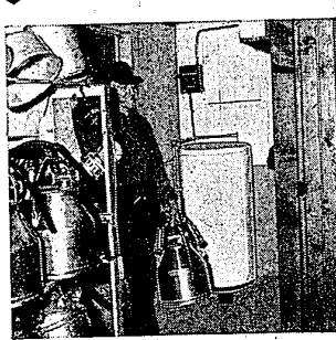
IN THE MILK HOUSE, a 30 gal. electric water heater keeps utensils sparkling clean, bacteria count low, milk checks high.

DETROIT EDISON 60 Years of Electric Service