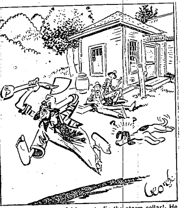
"Gran'pa is in an awful hurry to fix the storm cellar! He just heard about the atom bomb!"