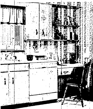
THE DECOR IS EARLY American, but the emphasis is very contemporary. Convenience, modern style, is a dishwasher to cut down on clean-up time.