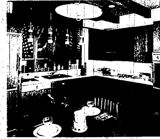
KITCHENS TOP the list of popular remodeling projects, and new kitchens are as likely to be updated as those about 20 years old. Most remodeling aims at beauty, low care, improved layout and convenient appliances.

were queried through National Family Opinion, Inc., with a record 75.5 per cent responding. These facts on kitchens were disclosed: • More than 56 per cent of the remodeling jobs were done by the homeowner, 21 per cent used some professional help, and 23 per cent were done entirely by "pros." • Remodeling is most often done by middle-income families and in moderately-priced homes. However, salary levels of families engaged in kitchen improvement ranged from less than $5000 to well above $15,000. • Suburbanites do more kitchen remodeling than either city or rural residents. • Remodeled kitchens (and bathrooms) are considered to provide "most good" for the entire family and be "well worth the investment."