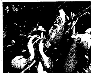
THESE EARLY CROOKNECK squash are just the right size for picking. The exterior skin is golden, and the interior flesh is creamy yellow, tender and delicious, especially when cooked and served with tomatoes.

Others like the crooknecks are warted and misshapen -- but again the creamy yellow interior when cooked and served with butter is a gourmet's delight.