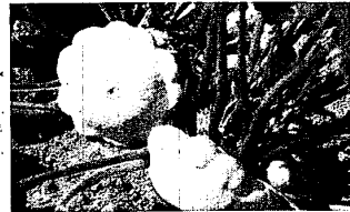
PATTI-PAN SQUASH are shaped like flying saucers. The exterior can be white or yellow according to variety, and they are best eaten when young and tender -- about an inch across. Left on the plant some will grow to the size of dinner plates, and they make interesting Halloween decorations. Patti-pan squash grow on bushy plants and do not take up much room in the garden.

BUTTERNUT SQUASH must remain on the vine until fully mature. They are best gathered before fall frosts, leaving part of the stem attached to the fruit. They are best stored over winter in a dry place, and prefer a cool temperature between 45 degrees and 55 degrees. Butternut squash are best sliced lengthways and cooked until tender with the seeds removed. Exterior color is buff-brown with orange interior. They are delicious cooked and served as Thanksgiving -- or anytime as a substitute for potatoes, even as "French fries."