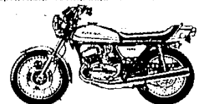
Come out ahead on a Kawasaki.