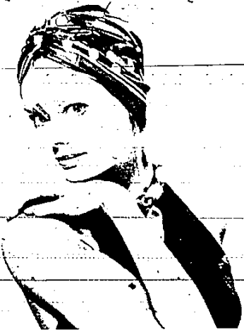
Wrap and go turban.

Aside from looking great, beautifully wrapped turbans can really be a vacation lifesaver. This up-dated look of an all-time classic is appropriate for almost any activity. It looks right on trains, busses and planes. It's comfortable for car travel and shopping. And it's marvelous for dining or entertaining.