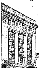
Downtown Headquarters Grissold at Lafayette