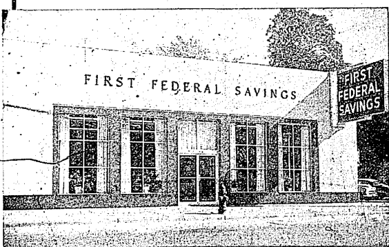
Redford Branch—Grand River at McNichols