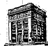
Downtown headquarters: Griswold at Lafayette, across from City Hall

A worthwhile current rate of 2% is paid on the entire amount of your savings here.