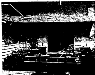
THIS OUTDOOR DECK can be used minutes after a rain and thus extends your outdoor season. Two talented do-it-yourselfers could build it on a weekend.

contain a lot of weed seeds, warns the horticulturist. Apply hay and straw mulches three to four inches deep for best results, recommends Taylor. Two inches of ground corn cobs, sawdust or shavings provide adequate mulching, too. Mulching materials such as straw, chopped corn cobs and sawdust are often low in nitrogen and may cause nitrogen deficiencies in the soil. To remedy this, add some nitrogen fertilizer. If straight nitrogen fertilizers aren't available, apply a pound of complete fertilizer.