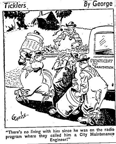
"There's no living with him since he was on the radio program where they called him a City Maintenance Engineer!"