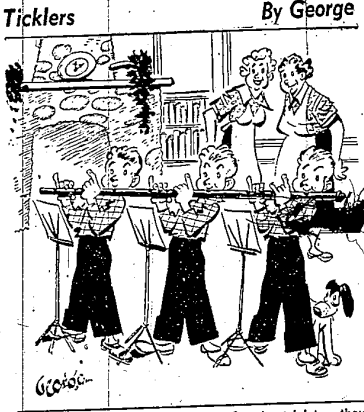
"We bought a custom-built flute for the triplets—they have TV possibilities, don't you think?"