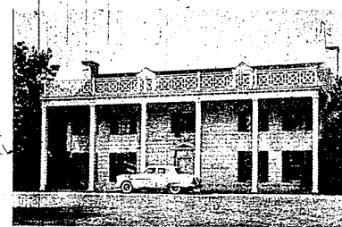
A COUNTRY CLUB to be known as the Farmington Country Club is now on the planning boards and will be modeled after the club shown above. The new country club will be located on Haggerty Road south of Twelve Mile Road. The main part of the club house will be 32 by 60 feet in size, with a full basement at the north end of the building.