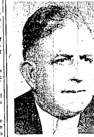
His Four Years Experience As A Councilman Should Be of Great Value to the Growing City of Farmington

This series of well known mental health films is being presented as a service to the community and all who are interested in the problems of family life are cordially invited to attend, and to participate in the group discussion which will follow the showing of the film.